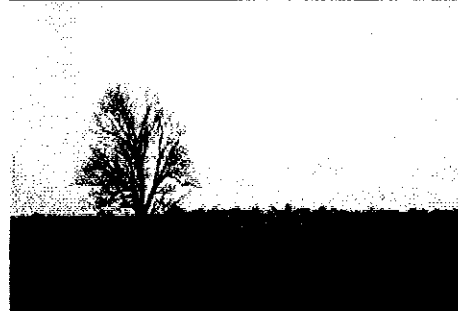
The bright lights of the Grand Casino (above) contrast sharply with a pastoral scene several miles west of downtown.